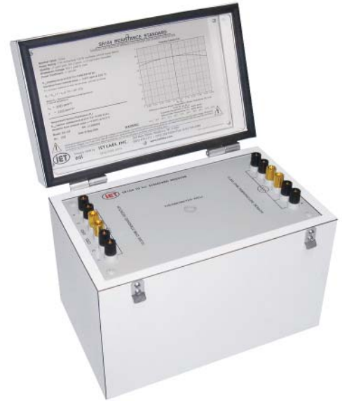
Transportable Resistance Standard